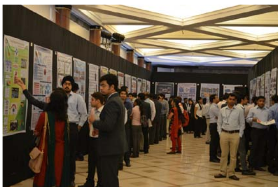
Fig 7: Poster Presentation in Progress