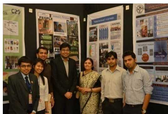
Fig 8: Students with Faculty Mentor