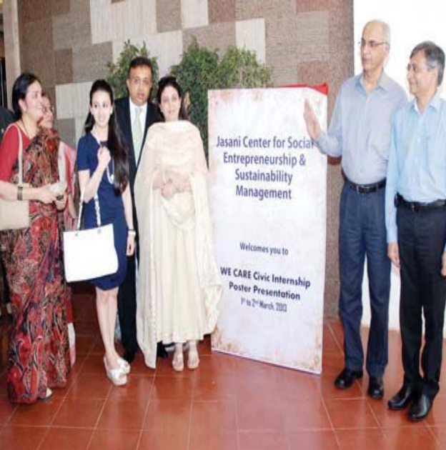
(Announcement of the Jasani Center on Jan 12, 2013)