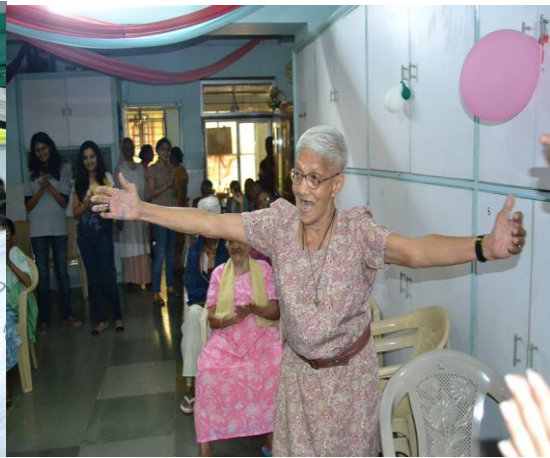
Member Expressing Her Gratitude towards the Students