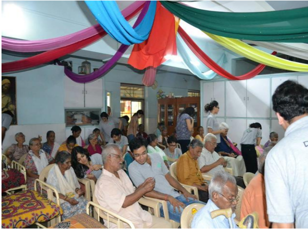
Members of Jeevan Asha Playing Housie