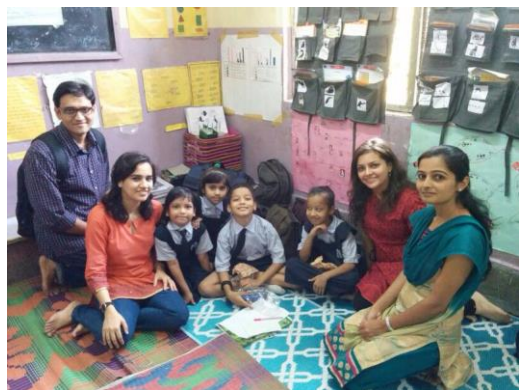
Students in Action during We Care Internship 2014

As scheduled, 449 students joined their respective internship organizations on 3 rd Feb. 2014. Out