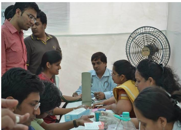
Blood Test Done before Blood Donation