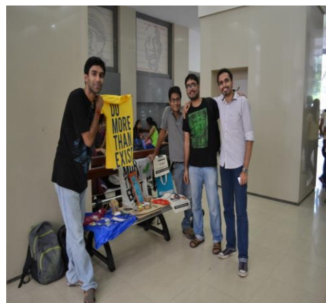
Participants of NGO Mela Competition