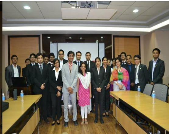
Participants with the Judges of Samadhaan