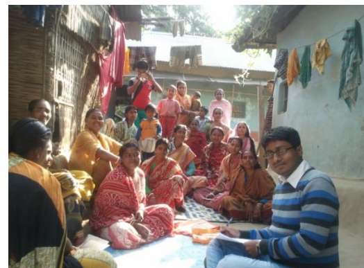
Students in Action during We Care Internship 2014

We Care 2014 project was initiated in June 2013. The first step entailed collection of student's personal data, preferences, and skill-sets. The next step involved the arduous task of strategically aligning the collected information with non-profit organizations engaged in wide range of activities all over India. Identification of the potential internship organizations was followed by establishing contacts over phone/emails and subsequent follow ups till they were connected with the students. To familiarize students with ground rules of working in the social sector, 20 orientation workshops were conducted by the student volunteers from NMIMS Social Responsibility Forum