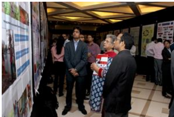
Students explaining their We Care Experience to Invited Judges

On 13 th March 2014 the Poster Presentation Event was organized to provide an opportunity to the students to showcase their learning and contributions during the internship.