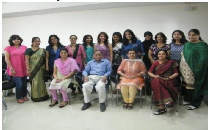
Fig 2: ETW Batch XXVIII

From the total of 17 students, 16 students successfully completed the programme and received their Certificates of Completion on April 16, 2013. ( See Fig 2 below)