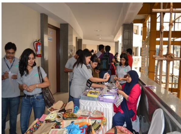
NGO Mela Stalls