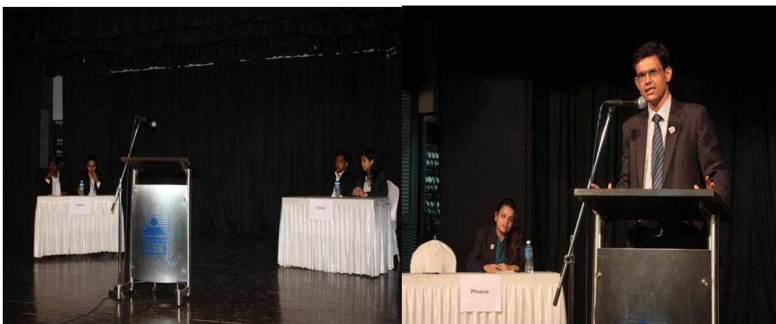
Participants of Canvass-Tug of Words