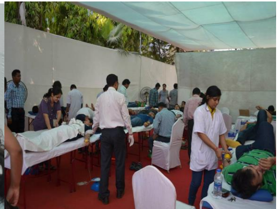
Blood Donation Drive, 2013