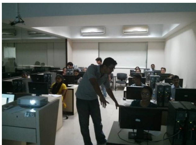
Students Guiding the NGO Members during MS Office Workshop