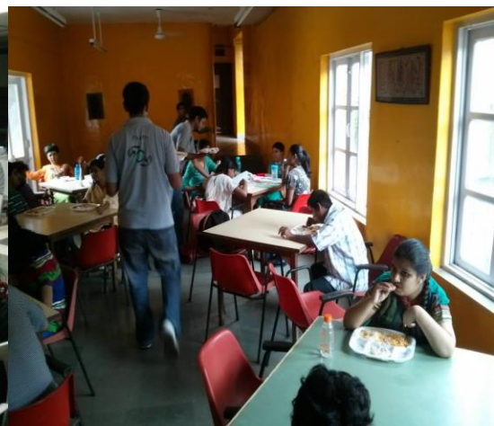
Students Serving Lunch