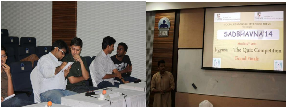
Participants of Jigyasa- The Quiz Competition