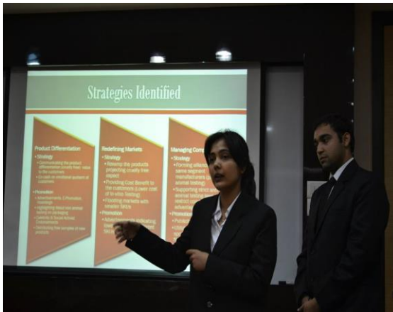
Students Presenting their Ideas at Samadhaan