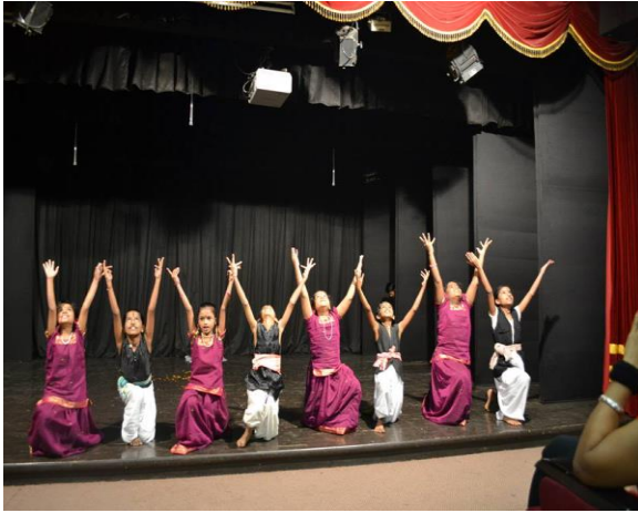
A Performance at Samakraman- NGO Skit & Dance Competition