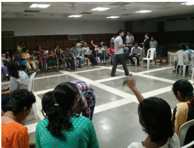
Students at National Resource Centre for Inclusion, Bandra