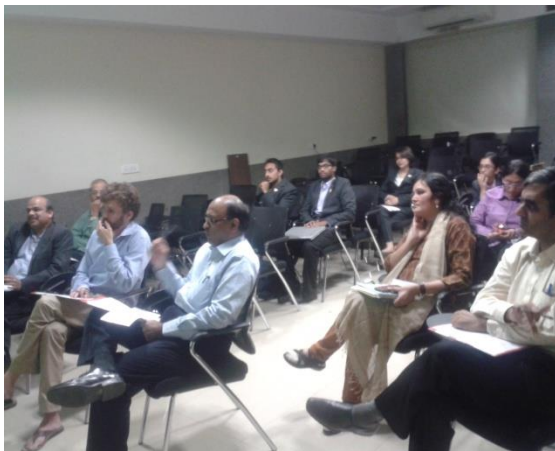
Esteemed Panel of Judges at We Innovate