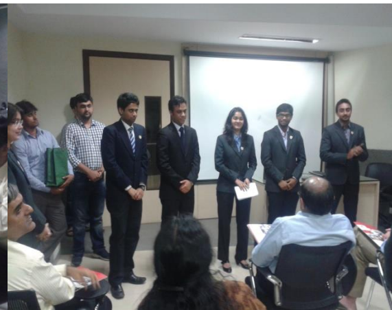
Finalists of We Innovate